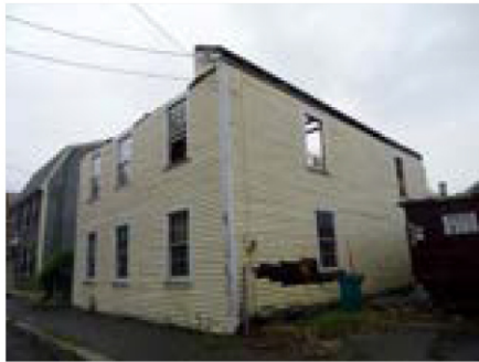
Partial demolition of this home in the Derby Street neighborhood was not regulated by the demo-delay ordinance.