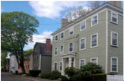
Homes protected by the Derby Street Local Historic District