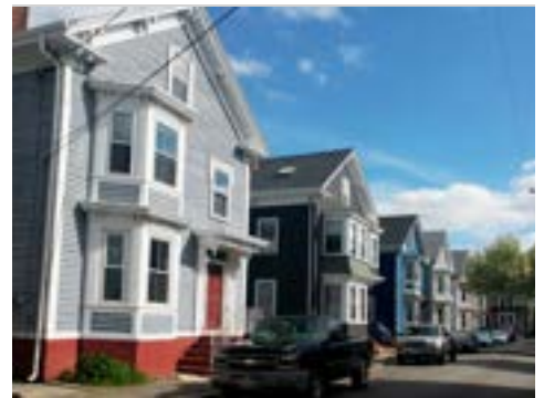
Gable roofs, bay windows and ornamental door canopies are defining features of these Boardman Street houses.

NPDs were studied in Salem in 2009 and a draft ordinance was written, however, no NPDs currently exist. To establish a NPD, the study recommendations would need to be updated and adopted into city ordinance.