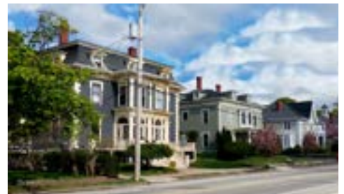
Homes protected in the Lafayette Street Local Historic District

This information is provided by Historic Salem, Inc. and is intended to be an overview for residents and neighborhoods to consider. If there is neighborhood interest in the possibility of a new or expanded LHD or establishing a NPD, the City of Salem (through the Historical Commission or City Council) would need to form a study group. The group would work with city councillors, city planning staff and interested community members to determine whether to move forward to with the appropriate option.