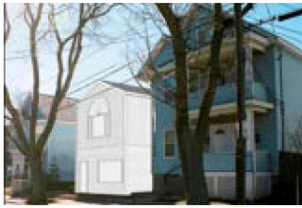
Example of new construction that doesn't fit the neighborhood character.