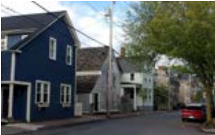
Homes of equal significance one block away on Essex Street, not included in a Local Historic District.

Preservation of our historic neighborhoods is a key element in continuing the success of Salem as an appealing place to live and visit.